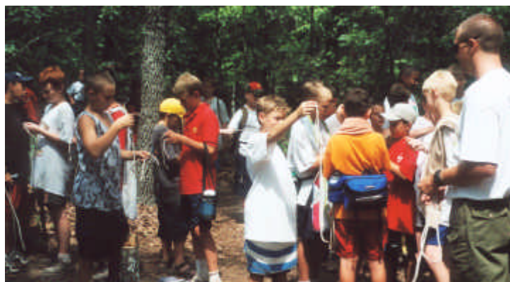
First Year Scouts are learning some knots at Voyager