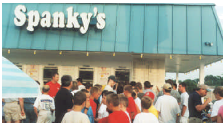
The Monday after summer camp, it is traditional that we have a Troop meeting at Spanky's for ice cream.