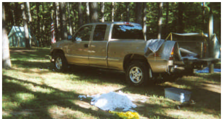
Wiley Raccoons TP'ed the Scoutmaster's truck at Hawn park