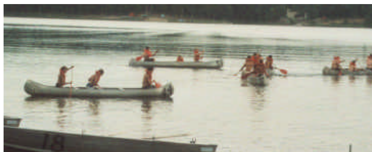
This is the Out & About part... big fun!