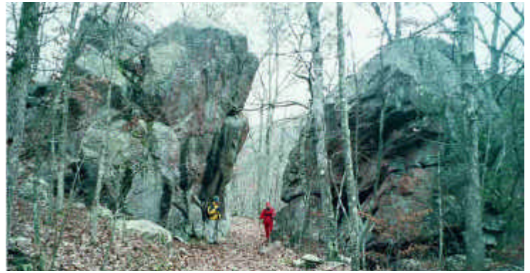
You should see the Devil's Toll Gate on the Taum Sauk hike