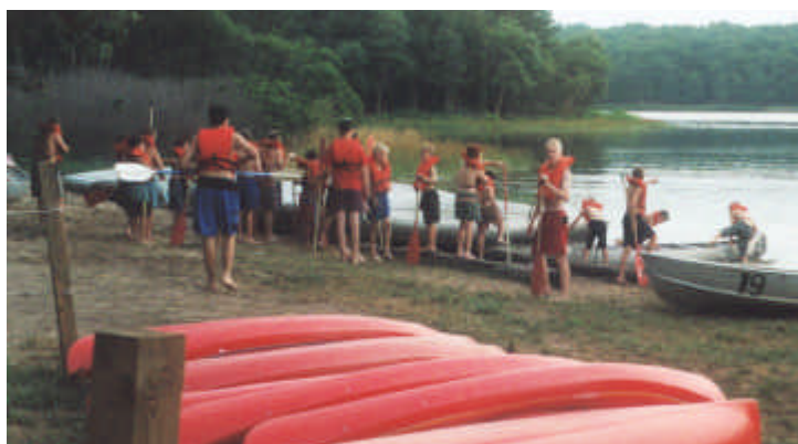
Scouts prepare to go on the "Out & About" canoe float